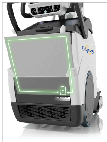
Detectors can be charged on board in the units charging slot.