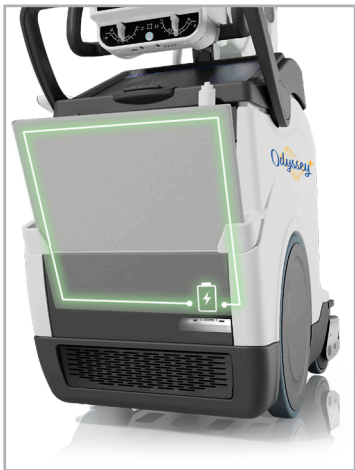
Detectors can be charged on board in the units charging slot.