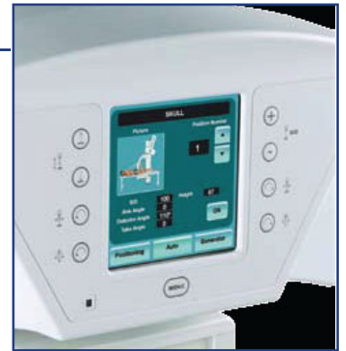
Refine equipment positions with the conveniently located control panel