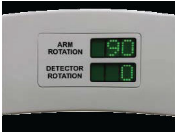
Large display of arm and detector rotation

Designed to give maximum flexibility with a minimal footprint, the AAU Elite DR system is an advanced, fully-integrated DR System that is driven through worklist commands. Ideal for all radiographic procedures including standing, seated, and recumbent positions.