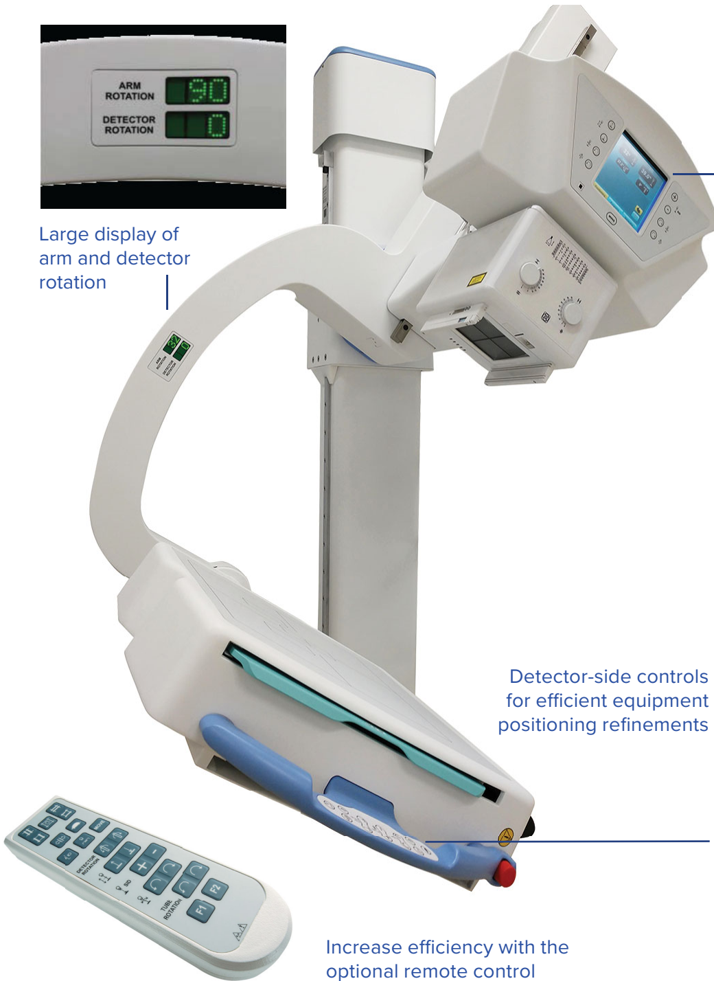
Detector-side controls for efficient equipment positioning refinements