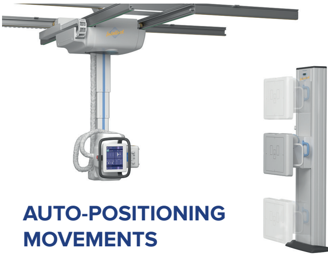
Image Quality is optimized with patient dose reduction.