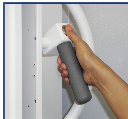
Ergonomic lock release handle on wallstand for ease of positioning