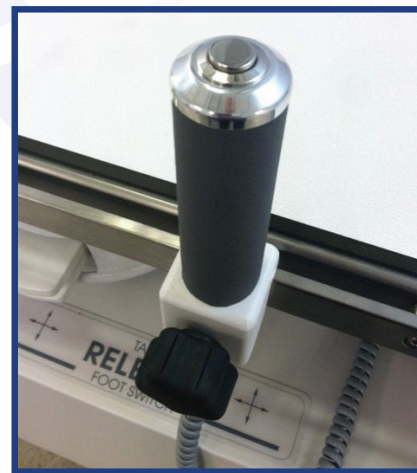
Table Elevation Control Handle (T.E.C.H.) with lock release