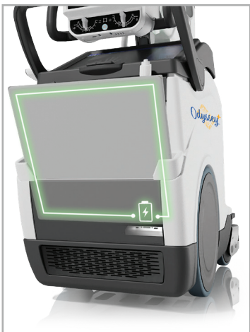
Detectors can be charged on board in the units charging slot.