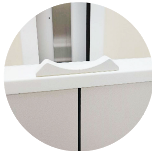
Comfortable chin rest