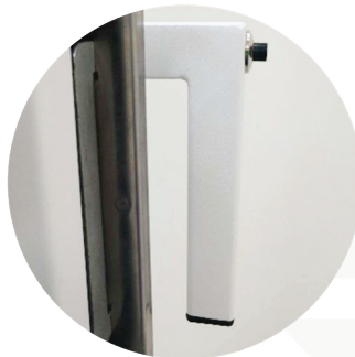
Push button Lock Release for quick positioning