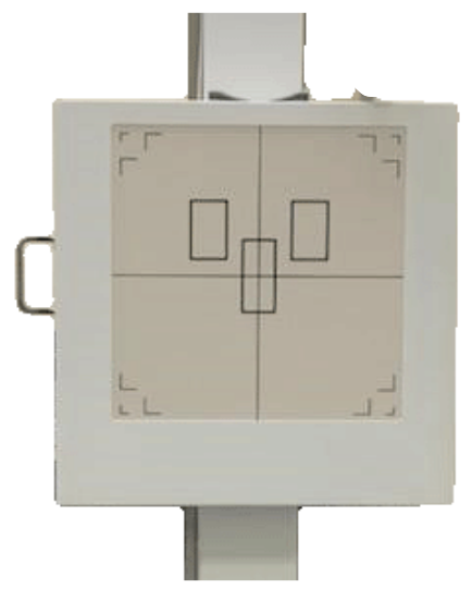
J1000 Premier Wall Stand