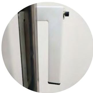
EZ lock release