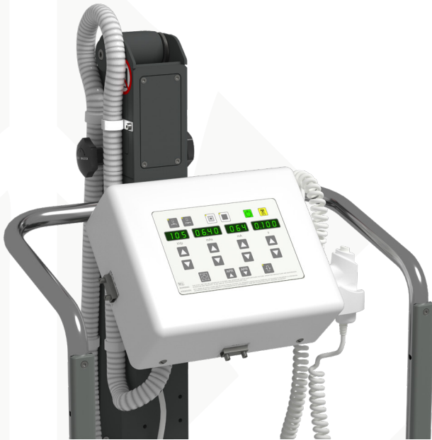
..... 1 Region APR Console MEMBRANE