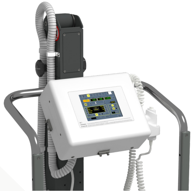
..... 6 Region APR Console TOUCHSCREEN